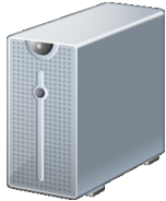
Server 1: Application Server